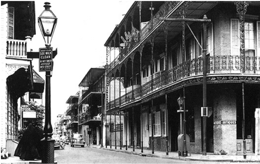
THE LATIN QUARTER IN NEW ORLEANS