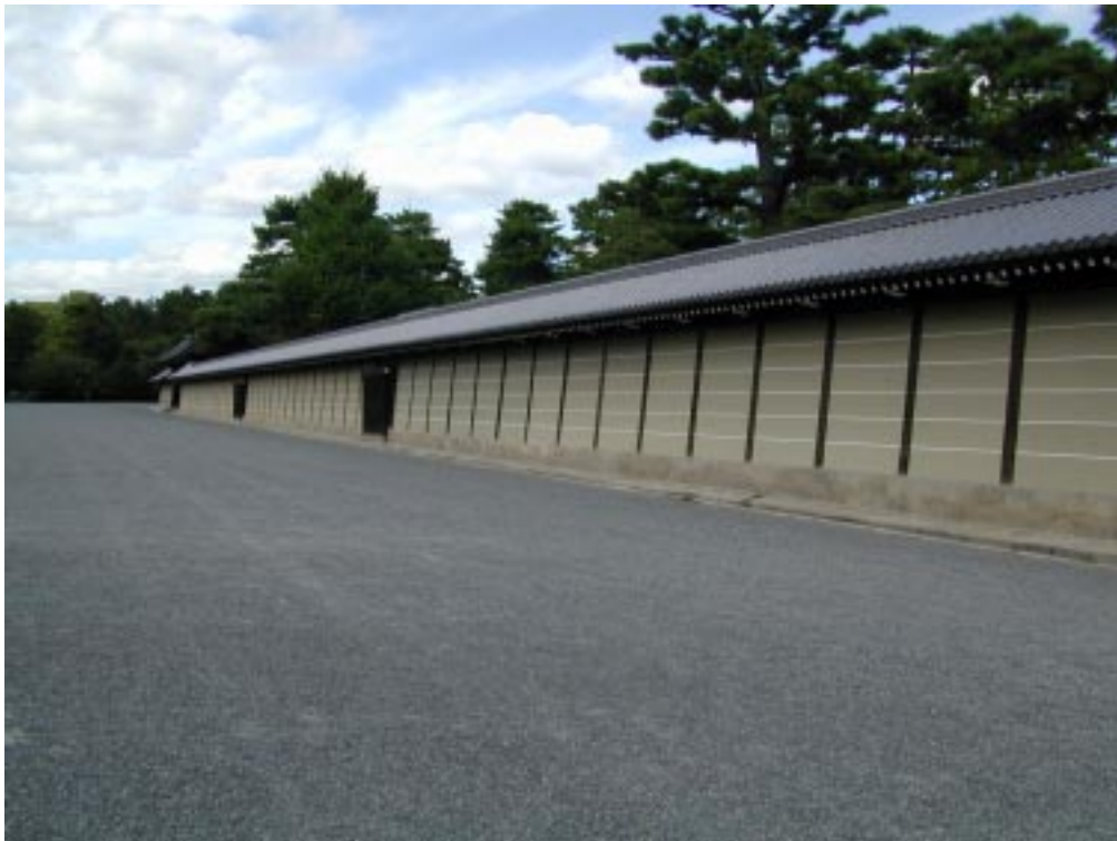
THE OUTER WALLS OF THE GOSHO, THE IMPERIAL VILLA, IN KYOTO JAPAN