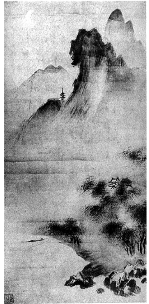
TWO EXAMPLES OF BRUSH PAINTING BY THE JAPANESE PAINTER, SESSHU (1420-1506) SHOWING THE USE OF THE WHITE PAPER AND THE VIEWER'S IMAGINATION AS ELEMENTS WHICH WORK TO CREATE ILLUSION AND REPRESENTATION BY MEANS OF A FEW STYLIZED BRUSH STROKES. ABOVE, WAVES AGAINST ROCKS AND RIGHT, A LANDSCAPE.

The understanding of style is a requirement not only for the composer or improviser but also for any interpreter. There is no real hard line between free improvisation and the kind of adjustment of interpretation and expression that is required in the performance of any music. Phrasing, attack, stress, vibrato, emphasis, tone quality, etc. are all musical elements that come together in a performance but that are minutely adjusted by every performer. It is the uniquely balanced proportions of these elements that identifies every performer or interpreter as effectively as if it were his own voice print.