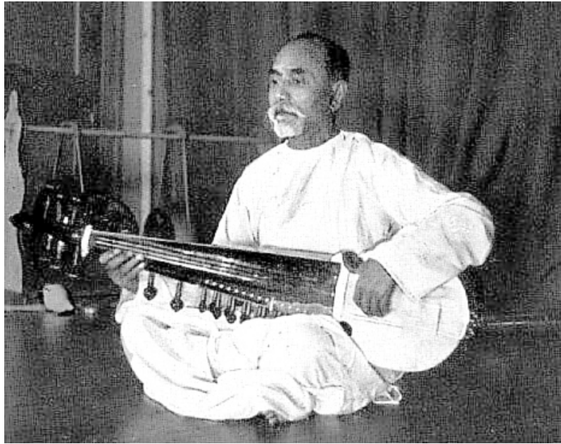
THE MASTER MUSICIAN, ALLAUDDIN KHAN PLAYING THE SARODE. FATHER AND TEACHER OF ALI AKBAR KHAN AND TEACHER OF RAVI SHANKAR, AS WELL AS GRANDFATHER OF ASHIH KHAN AND TEACHER, DIRECTLY AND INDIRECTLY TO HUNDREDS OF NORTH INDIAN CLASSICAL MUSICIANS, HE CAN TRULY BE THOUGHT OF AS THE GENERATING POINT OF A GREAT MUSIC TRADITION.

Even the conscious learning of a musical style is very complex. A young aspiring musician who dreams of playing “just like” some one whom he respects may attempt to study personally with the master. When this is not possible he must learn to listen carefully and remember.